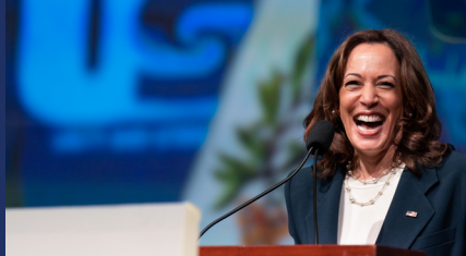
USA Vice-President Kamala Harris