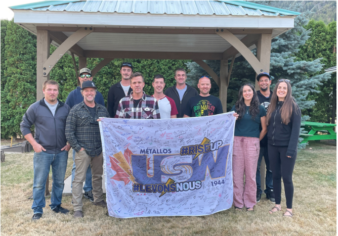
Unit 4 - Nelson Plant

Keep signing the Solidarity Flag to show your Union pride and support for bargaining. Stay tuned to know when the flag will pass near you!