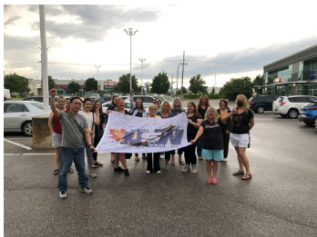
Unit 501 - Barrie Clerical