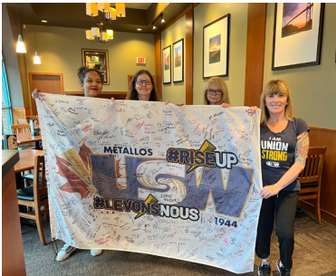
Unit 52 - New Westminster Clerical and Operators

Keep signing the Solidarity Flag to show your Union pride and support for bargaining. Stay tuned to know when the flag will pass near you!