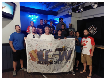
Unit 201 - Medicine Hat Plant

Check USW1944.CA for updates and info on when/ where to sign the flag when it comes to your