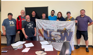
Unit 33 - Terrace Plant