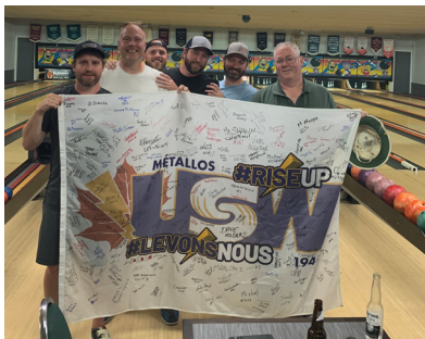
Unit 34 - Dawson Creek