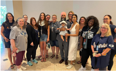
Women of Steel and Jagmeet Singh Leader of the NDP

After a five-year absence, we were pleased to attend the USW International Constitutional Convention. This Convention is where the USW sets policy using resolutions submitted by Locals and where any changes to the USW Constitution are initiated. The Convention is composed of thousands of delegates from Locals across North America. During the Convention, distinguished guests came to share their support.