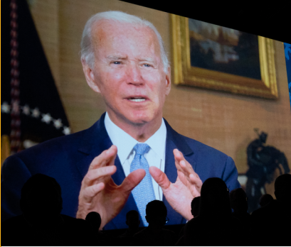
USA President Joe Biden

After a five-year absence, we were pleased to attend the USW International Constitutional Convention. This Convention is where the USW sets policy using resolutions submitted by Locals and where any changes to the USW Constitution are initiated. The Convention is composed of thousands of delegates from Locals across North America. During the Convention, distinguished guests came to share their support.