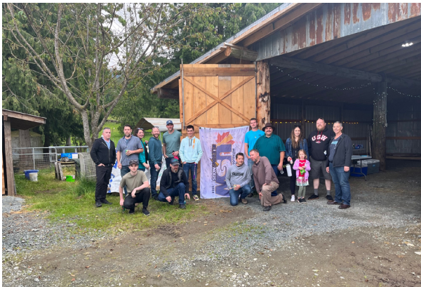
Unit 32 - Abbotsford/Mission Plant

Check USW1944.CA for updates and info on when/where to sign the flag when it comes to your Unit!