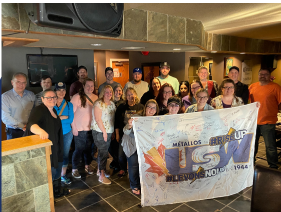
Unit 53 - Prince George Clerical, Plant, Traffic

Check USW1944.CA for updates and info on when/where to sign the flag when it comes to your Unit!