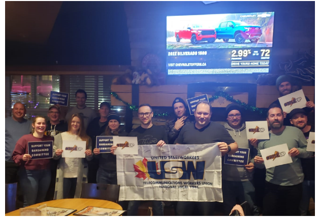
Unit 8 - Kamloops - Plant