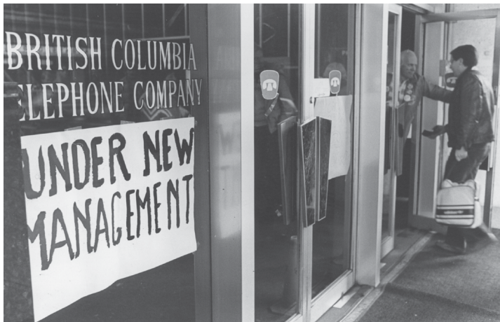
Occupation of BC Tel's William Farrell Building in Vancouver. February 6, 1981.

Following that lengthy strike, the telephone company began to take steps to improve the labour climate.