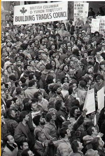
Unionists outside BC Tel Company's William Farrell Building in Vancouver. Feb. 10, 1981.