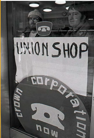
TWU members occupying BC Tel's William Farrell Building. Feb. 6, 1981.

Bailey Garden describes the 1980-81 BC Tel strike as "an inspiring example of workers using new tactics to cope with an aggressively anti-union employer".