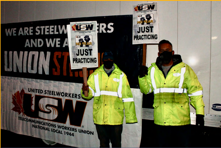
On February 3 rd , members from Unit 60 Shaw Abbotsford gathered outside of their compound for a Practice Picket Rally.