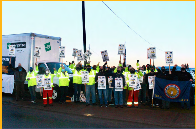
February 3 rd : Unit 60 Shaw Abbotsford's picket practice with support from USW District 3 and IBEW 213.