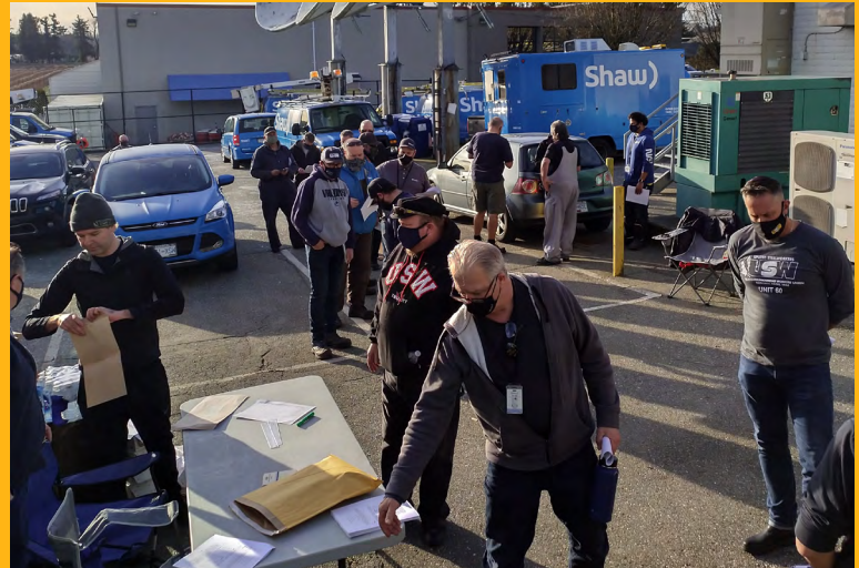
March 8 th : Members from Unit 60 Shaw Abbotsford cast their votes.