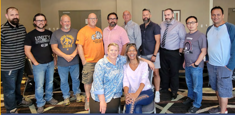
On August 16 th –19 th , members of the USW Local 1944 – Telus Bargaining Committee met in person in Burnaby, BC.