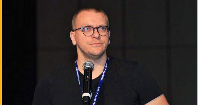
On November 24–26, 2021, delegates from Local 1944 attended the United Steelworkers / Métallos 57 th Annual conference in Saint-Hyacinthe, QC (see next page).

Send your photos at communications@usw1944.ca