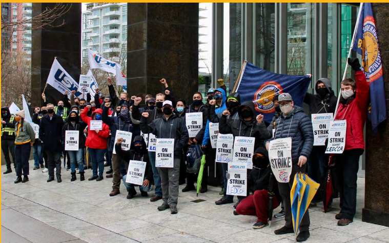
On March 19 th , Regional Executive Officer, Local Union Representative and Staff Representative from Local 1944 joined a rally with IBEW Local 213 members employed at Ledcor LTS.