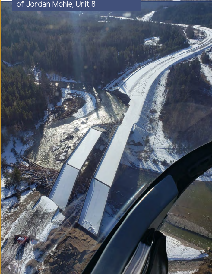
Above and below: Photos courtesy of Jordan Mohle, Unit 8