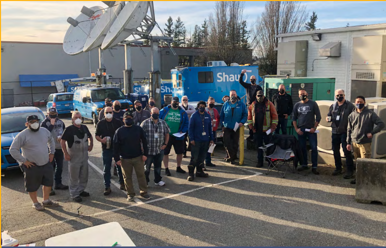
On March 8 th , members from Unit 60 Shaw Abbotsford voted 85.7% in favour of ratifying a collective agreement with their employer.