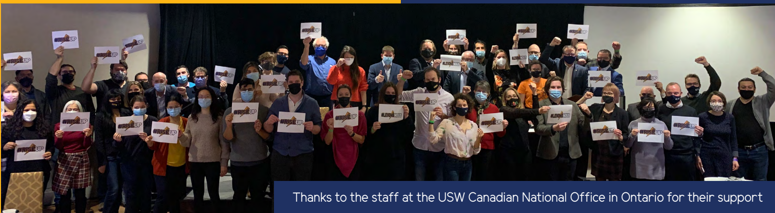
Thanks to the staff at the USW Canadian National Office in Ontario for their support

Download the #RiseUp poster here , take a picture or selfie and email it at communications@usw1944.ca