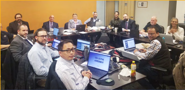
Early November, the USW Local 1944 – Telus Bargaining Committee met again at the head office in Burnaby, BC.