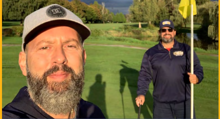
On September 19 th , Unit 60 held its Annual Golf Tournament, at the Surrey Golf Course, BC.