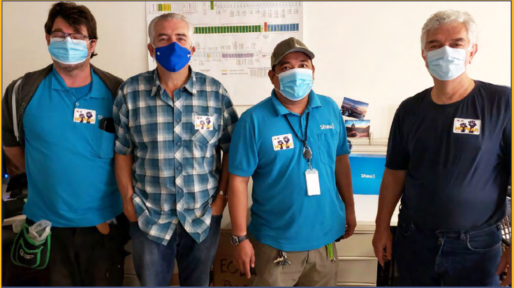
On September 17 th , members from Unit 60 Abbotsford showed solidarity with their Bargaining Committee by proudly wearing #NoFear stickers.