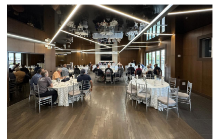
Unit 60 delegates and members during their first town hall meeting on Tuesday, June 27th at Aria Banquet and Convention Centre in Surrey, BC