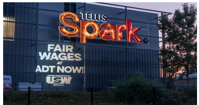
USW's "bat light" projecting a clear message "Fair wages at ADT now" onto the Telus Spark Science Centre building and the Scotiabank Saddledome.