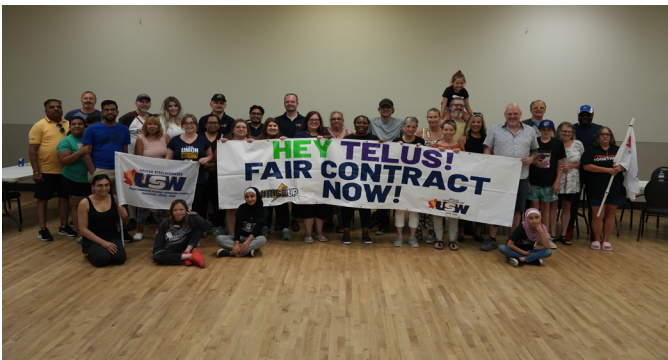
ADT and USW members at a BBQ event in Calgary, held in support of ADT workers and their Bargaining Committee.