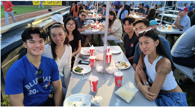
Unit 60 members and their families enjoying a baseball game at the Annual Day at the Ballpark BBQ.