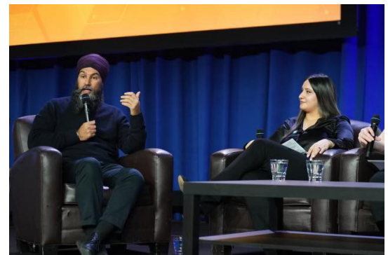
NDP leader Jagmeet Singh provided some remarks during a panel session.