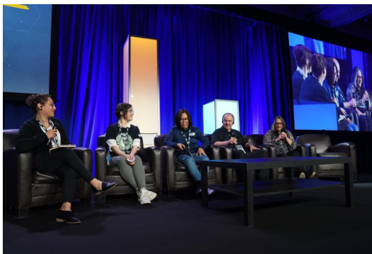
Panel on mobilizing for a better future