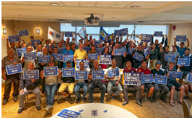
Unit 60 delegates and members during their town hall meeting on Tuesday, July 4th in Vancouver.

As was shared in Bargaining Update 7, the Bargaining Committee made an official request to enter the Federal Conciliation process, which has now begun, and we believe that Unit 60 members clearly understand what they're looking for in a contract that they can rely on and be proud of. Your collective solidarity and resolve will deliver a contract you deserve.