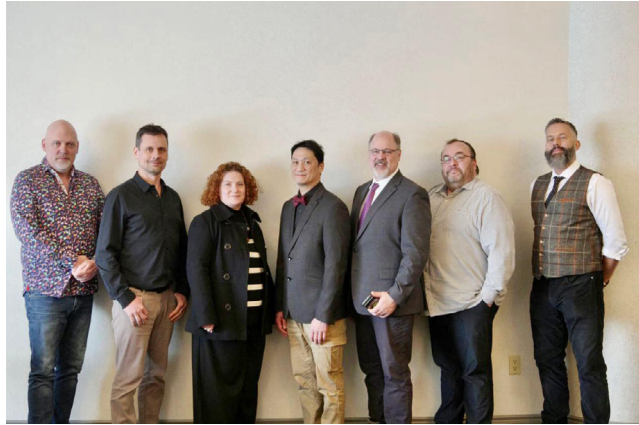
Members of the Bargaining Committee

services by demanding minimum employee counts and duration to secure a contract. Translated, this means more job security for contractors over USW members. Further explanations by the company detailed how they were looking for efficiencies in the routing system. Having a contractor with a work order be able to do a nearby service order would make routing more efficient, they say. Those of us who have experienced the debacle of automated routing over the past decade know that the inefficiencies existed long before 2018. We are steadfast against relinquishing job security to allow the company to test yet another theory on how to best tweak their routing software's productivity.