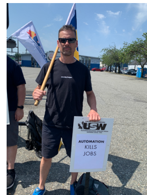
Members from our Local and the District 3 office showed up in numbers to stand in solidarity with our ILWU brothers and sisters.

At the core of ILWU's demands was the urgent need for recognition of the challenges faced by workers concerning the cost of living. As corporate profits soar, the disparity between the workers' livelihood and the prosperity of BCMEA's member companies remains a glaring concern.