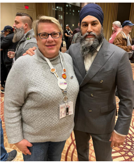
Along with NDP leader and MP Jagmeet Singh

USW Local 1944 was represented at the 17th Biennial Convention of the Ontario Federation of Labour in Toronto, where the renewed energy of the labour movement focused on organizing workers, building workers' power, and striving for a better future for both workers and communities.