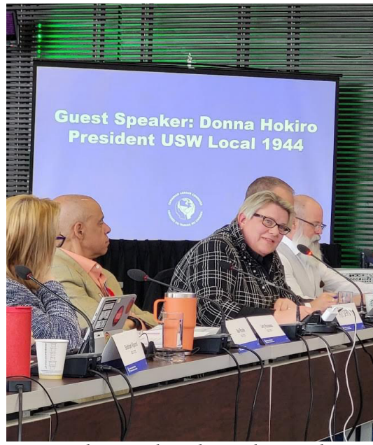
Our President speaking during the Canadian Council meeting of the Congress..