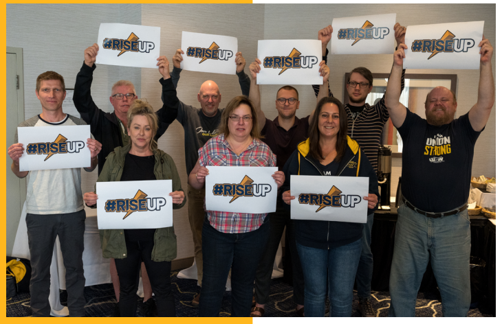
Our Local Union Representatives #RiseUP for 1944