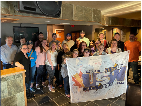
Unit 53 - Prince George Clerical, Plant, Traffic

Check Usw1944.ca for updates and info on when/where to sign the flag when it comes to your Unit!