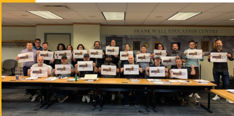
District 3 Staff #RiseUP in support of Local 1944