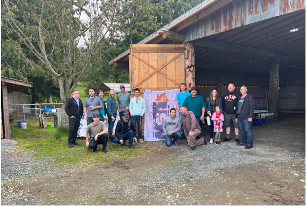
Unit 32 - Abbotsford/Mission Plant

Check Usw1944.ca for updates and info on when/where to sign the flag when it comes to your Unit!