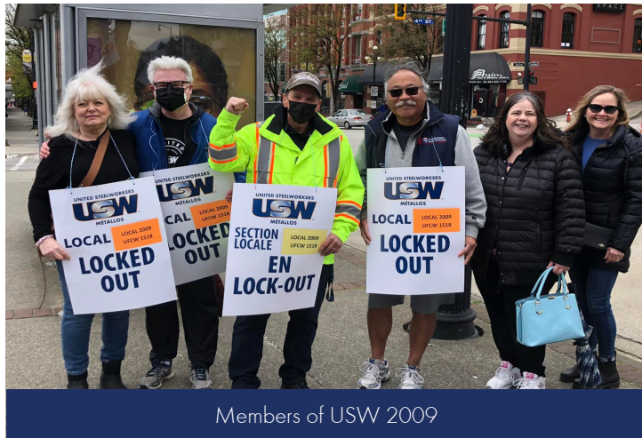
Members of USW 2009