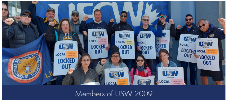
Members of USW 2009