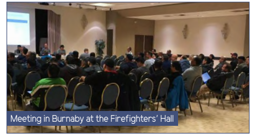
Meeting in Burnaby at the Firefighters' Hall

Thank you to all members who took on their free time to attend these meetings. When changes are to be decided upon, it is important that you take part in the decision process. Your voice matters, let it be heard!