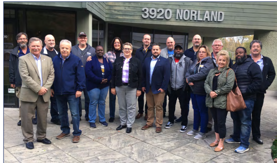
Please visit http://1944.fyi/Union-Reps when you need to find contact info for your Local Union Representative.