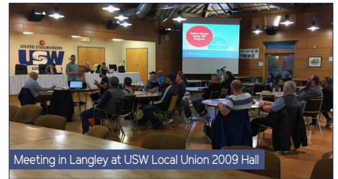
Meeting in Langley at USW Local Union 2009 Hall