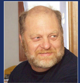
Tribute to former TWU Vice-President