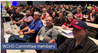
WCHS Committee members