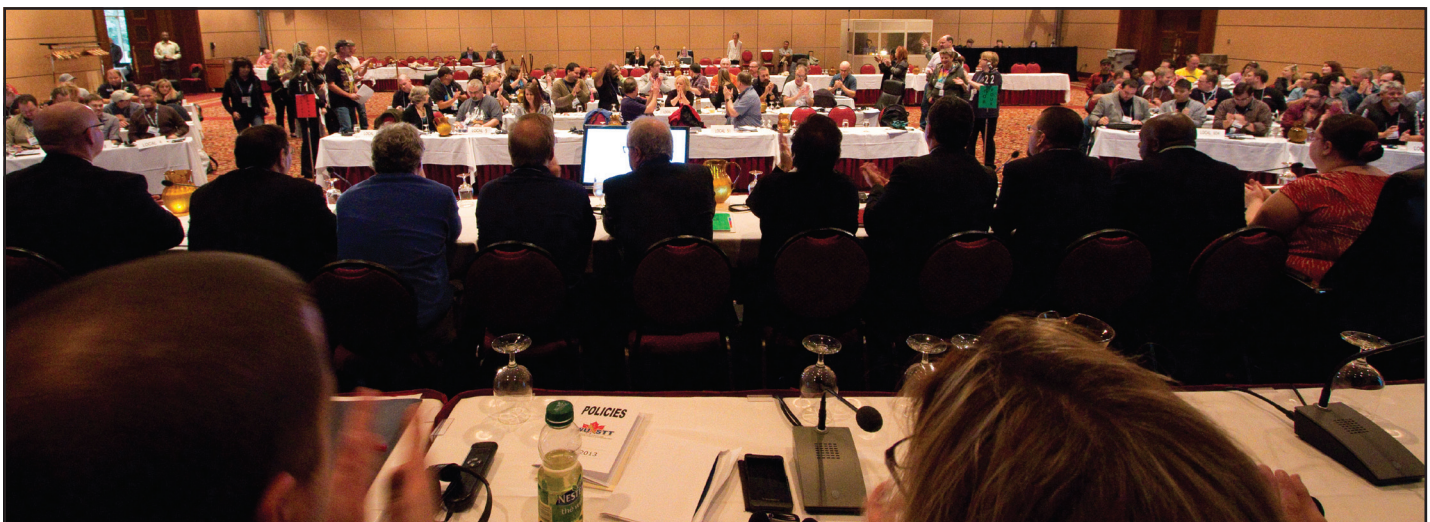
View from National Executive Council table at Special Convention 2013 in Gatineau, Québec.

Visit www.stopthekilling.ca to watch a short video and sign the petition.