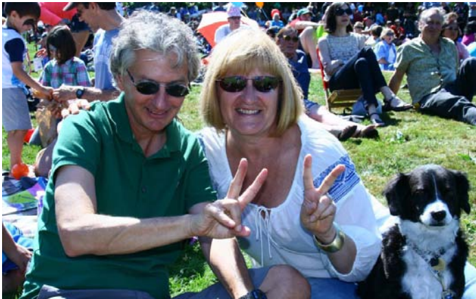
Peace and love.

Thousands in Canada celebrated workers this past Labour Day. From marches to picnics, Canadians from coast to coast joined together in solidarity. Union members waved their banners and flags with pride, knowing the importance and historical role unions have played in changing the landscape of the workplace and improving workers' rights.