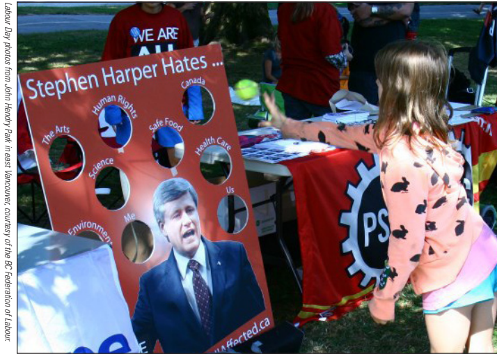
Fun games for children.

Thousands in Canada celebrated workers this past Labour Day. From marches to picnics, Canadians from coast to coast joined together in solidarity. Union members waved their banners and flags with pride, knowing the importance and historical role unions have played in changing the landscape of the workplace and improving workers' rights.