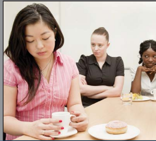
Members Ratify Agreement • Why My Union Matters to Me • Workplace Bullying