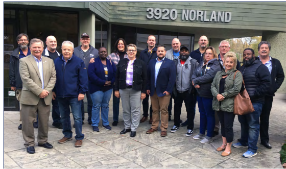
Please visit http://1944.fyi/Union-Reps when you need to find contact info for your Local Union Representative.