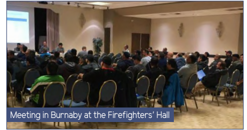
Meeting in Burnaby at the Firefighters' Hall

Thank you to all members who took on their free time to attend these meetings. When changes are to be decided upon, it is important that you take part in the decision process. Your voice matters, let it be heard!