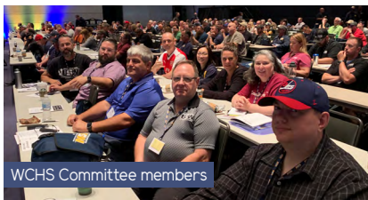
WCHS Committee members