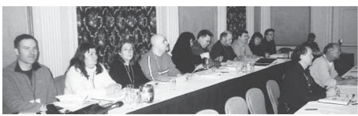
TWU bargaining team reports to convention delegates on status of negotiations with TELUS

"We welcome the opportunity to engage in binding arbitration. Binding arbitration provides a process whereby TELUS can arrive at a new collective agreement that supports our team's future competitiveness."