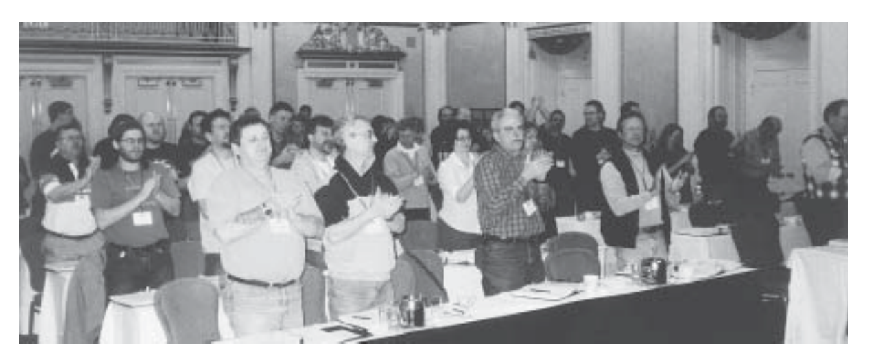
Delegates to TWU convention held in Calgary March 1-5

Additional information on rivusglobal.com Inc. and the products and services they offer can be found on their corporate website at <a href="https://www.rivusglobal.com">www.rivusglobal.com</a>