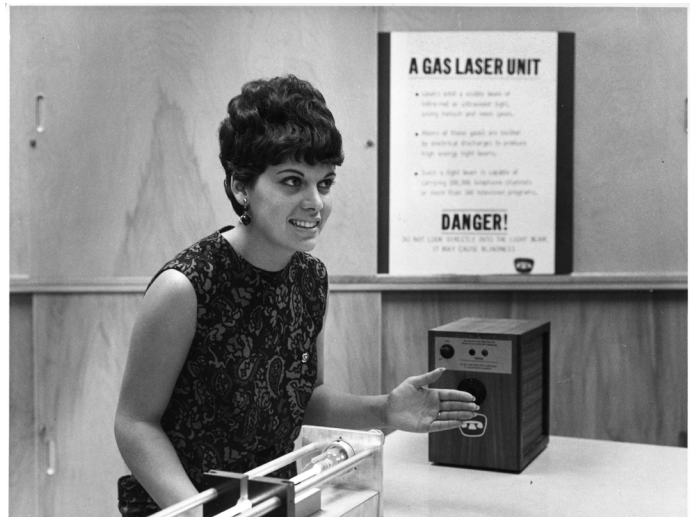
Laser Demo Oct 21 1966