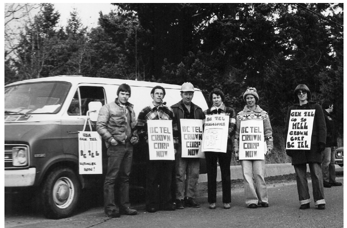
BC Tel Strike 1981