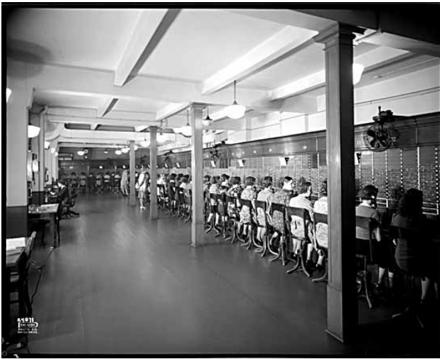
Operators at BC Tel's Seymour exchange 1940's