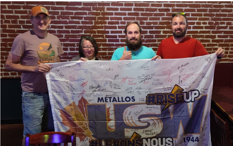
Unit 201 - Medicine Hat, AB