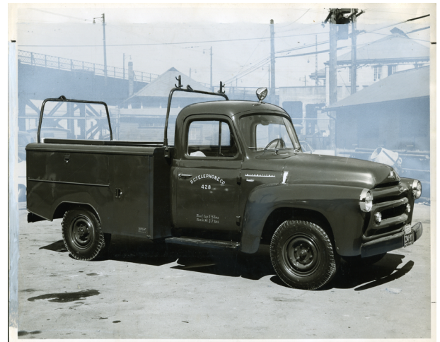
BC Tel Truck 1956