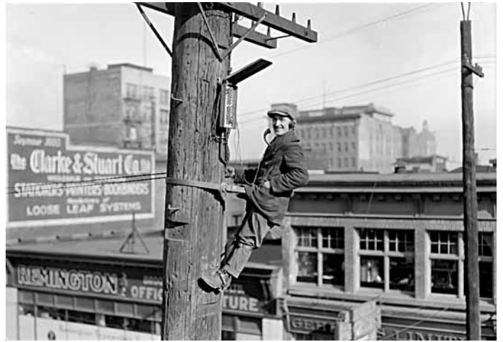
BC Tel Lineman 1927