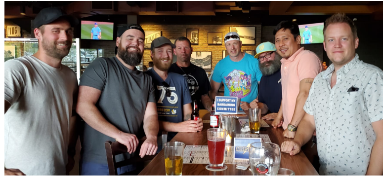
Unit 3 - Duncan, BC