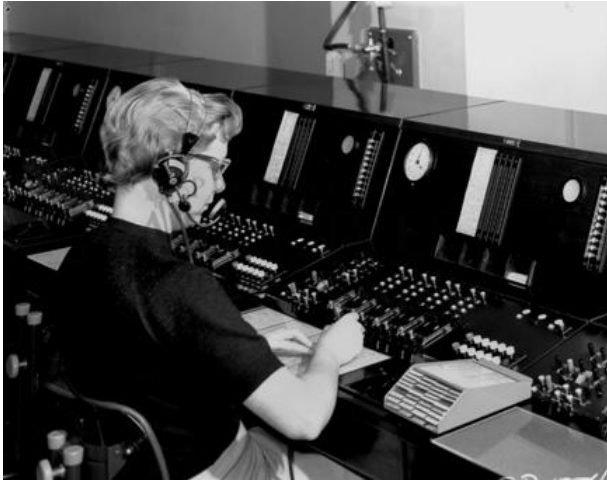
AGT Telephone Operator 1960