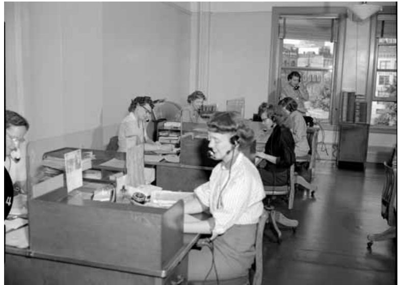
BC Tel Operators 1954