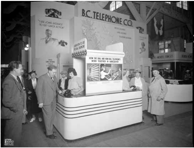
BC Tel Display 1940