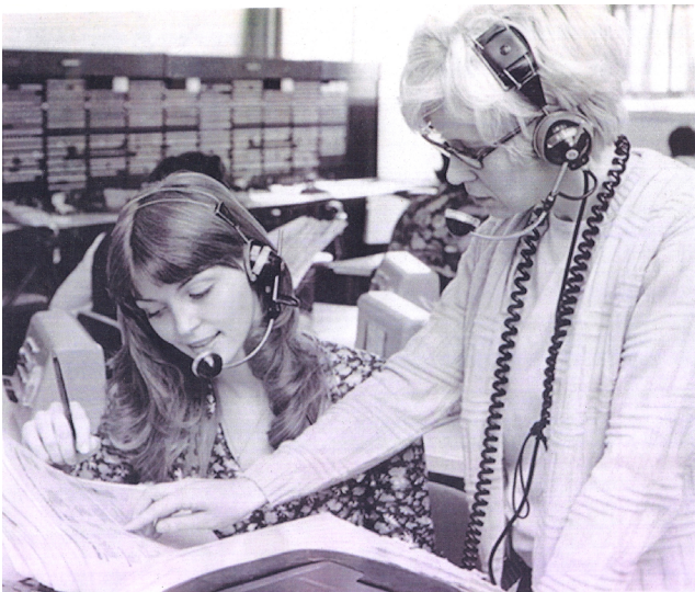
BC Tel operators 1971