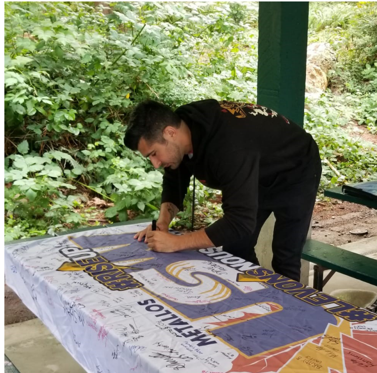
Unit 3 - Nanaimo, BC