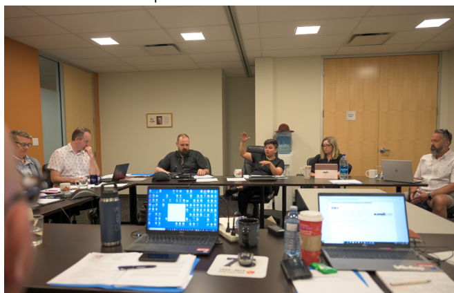
The Executive Board in discussion