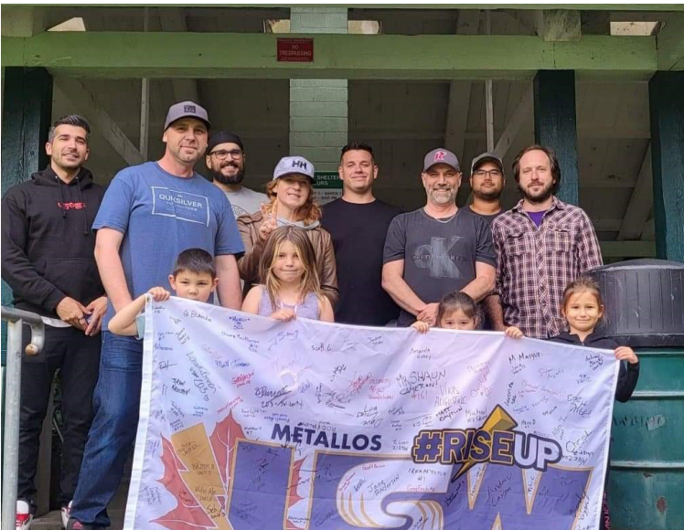
Unit 3 - Nanaimo, BC