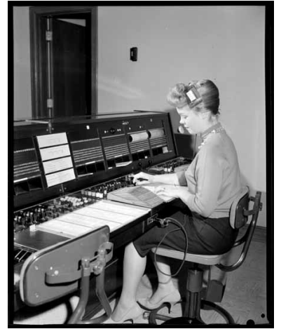
BC TEL Automation 1960