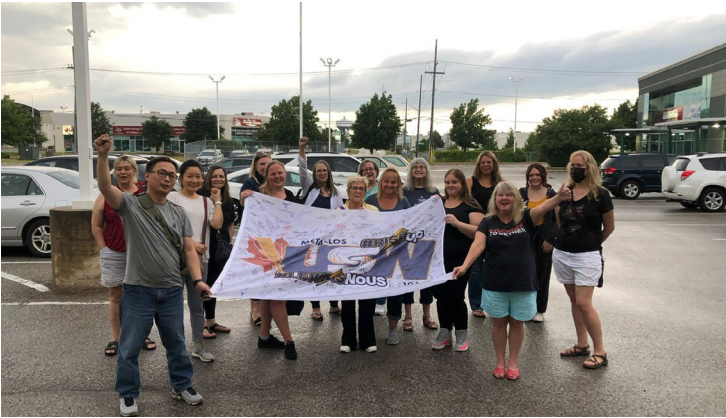
Unit 501 - Barrie, ON