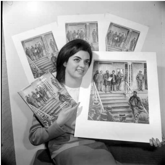
BC Tel new phone book cover 1965