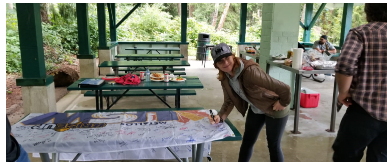
Unit 3 - Nanaimo, BC