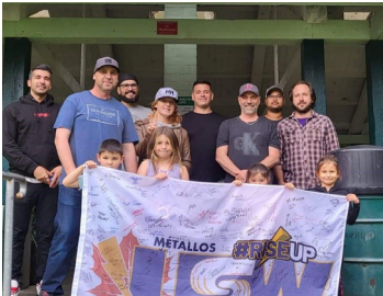
Unit 3 - Nanaimo, BC