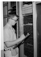
AGT Telephone Tech 1960