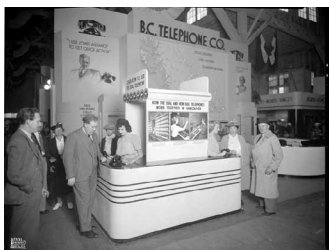
BC Tel Display 1940