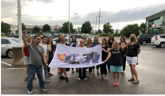
Unit 501 - Barrie, ON