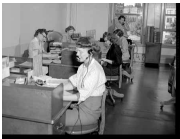
BC Tel Operators 1954