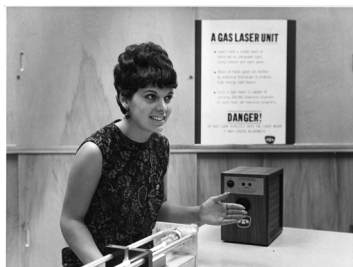
Laser Demo Oct 21 1966