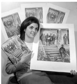
BC Tel new phone book cover 1965