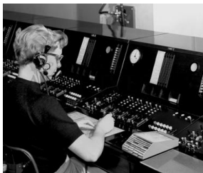
AGT Telephone Operator 1960