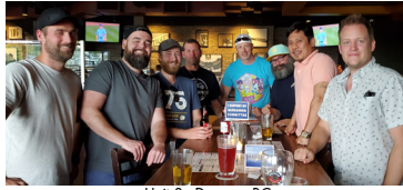
Unit 3 - Duncan, BC