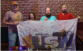
Unit 201 - Medicine Hat, AB