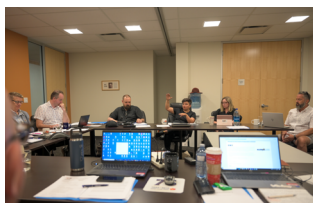
The Executive Board in discussion