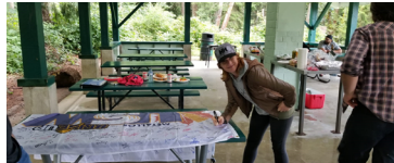
Unit 3 - Nanaimo, BC