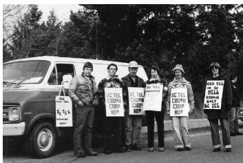
BC Tel Strike 1981