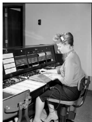
BC TEL Automation 1960