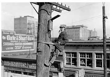
BC Tel Lineman 1927