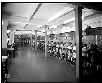
Operators at BC Tel's Seymour exchange 1940's