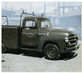
BC Tel Truck 1956