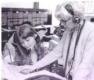
BC Tel operators 1971