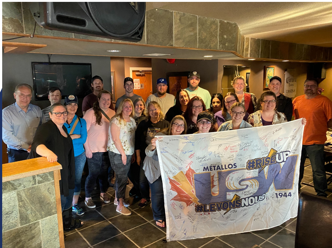
Unit 53 - Prince George Clerical, Plant, Traffic

Check USW1944.CA for updates and info on when/where to sign the flag when it comes to your Unit!