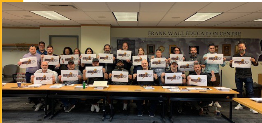
District 3 Staff #RiseUP in support of Local 1944